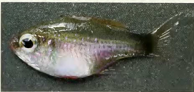
FIGURE 2. Holotype of Zoramia flebila , CAS 222057.

Color in alcohol: Head and body straw yellow. Top of head and sides of body, except area under and below pectoral fin, covered with tiny, scattered melanophores. Melanophores more concentrated on caudal peduncle, forming a band. A small black spot about half a pupil diameter centered on side of band. Area under eye, preopercle and opercle lacking pigment. Snout and lower jaw with scattered melanophores. Area between isthmus and insertion of pelvic fins with scattered melanophores. Pupil of eye dark, surrounded by silvery iris. First and second dorsal, caudal, and pelvic fins covered with scattered melanophores. Anal fin clear except for a row of melanophores along its base. Pectoral fins clear.